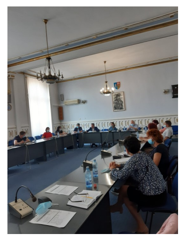
The main problems that the rural environment is facing: depopulation and accentuated aging of the population